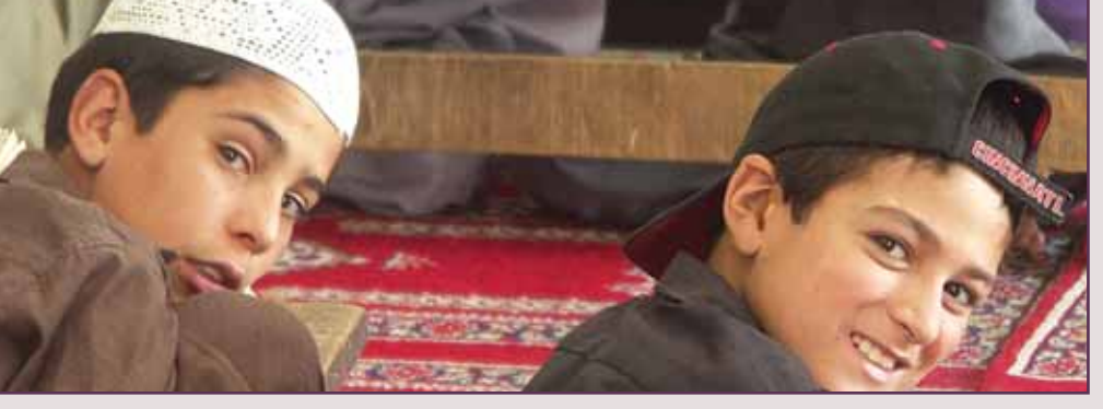
Young students study the Qur'an after morning prayers at Shahi Masjid, Chitral

countries, the language used on the streets changed every few hours you journeyed. In Pakistan, for example, it was not only Urdu whose sounds and inflections dominated conversations, but also Baluchi, Sindhi, Punjabi, Saraiki and Pashtu the further up your finger glided on the map. In its northern reaches, entirely different linguistic families emerged: Khoar, Shina, Burushaski, Balti and Wakhi. While sometimes an interpreter was useful, other times, the language of language had designs of its own.