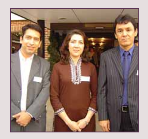
Alumni Reunion, London, September 2007