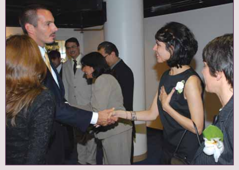
Alumni reception, London, September 2007