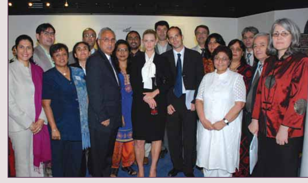
Alumni Reception, London, September 2007

It is events such as these that make it so special to be an IIS Alumnus: to be invited to a reunion which not only brings us back to the place where it all started, but also ensures that we continue to move forward in the intellectual study of our faith; we continue to search and learn. There is a tie that binds all of us that is much greater than simply being graduates of the same institution. It is this tie that brings us back time and time again.