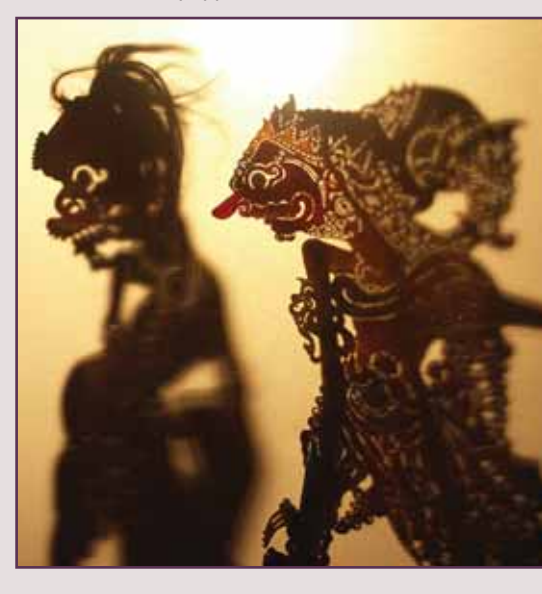
Rama and Sinta puppet show, Indonesia

Fieldwork never ceases to surprise; its beauty and pain lies in its ability to unceasingly force us to revisit our assumptions. It allows us to interrogate the lenses through which we see our world and the ways in which the world sees us.