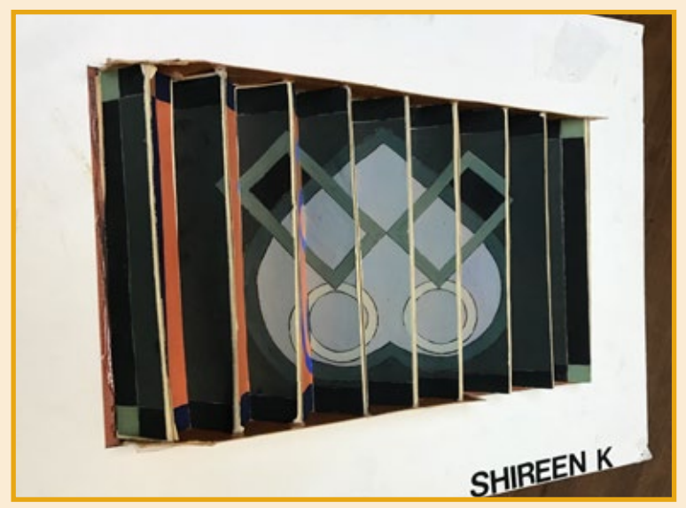
The IIS logo, chosen for a grade 8 art assignment and then submitted for a higher secondary art exhibit, while I was still in middle school. Twenty years later, the IIS became my alma mater.

am a product of my parents' and teachers' inspiration, and that the greatest of my aspirations involves serving the larger human community. In fact, I wonder at the nature of the word "aspirations": does it represent the future hopes one wishes to achieve or the visions of a transcendent nature one fulfils?