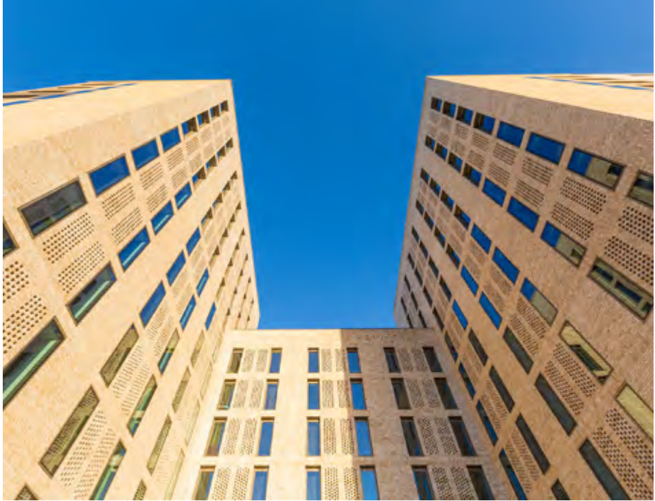
Victoria Hall, Kings Cross.